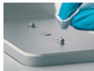
Quick and easy cleaning