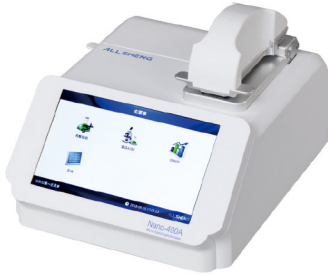
Nano-400A ultra-micro nucleic acid analyzer